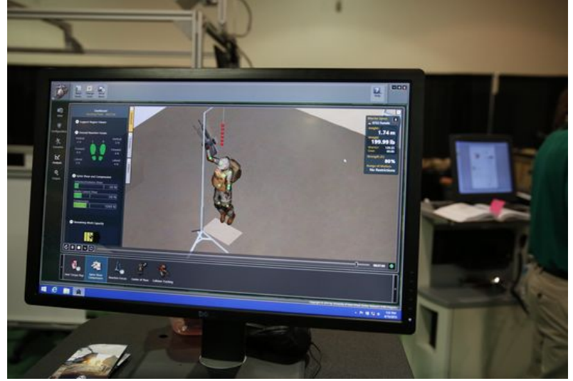
GruntSim, a computer simulation program, allows gear designers to outfit Marines with whichever pieces of kit they choose before running them through a virtual obstacle course that highlights joint stress.

Perhaps the most significant piece of wizardry on display by Gruntworks was a body mechanics computer simulator called GruntSim. Using a 3-D computer-aided design capability, it allows gear developers to kit up a Marine avatar any way they can imagine before running them through a virtual obstacle course.