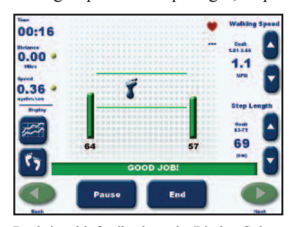
Real-time biofeedback on the Biodex Gait Trainer 3 prompts patients into a correct gait pattern.

speed and right-toleft time distribution (step symmetry) are displayed versus a desired footfall pattern. After each session, patient performance can be printed out to document improvement to both patients and payers.